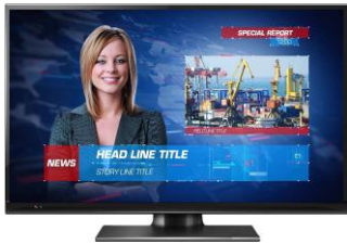
News Channel/Movies 1Mbps Full HD