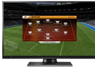
Sports Channel 2Mbps Full HD